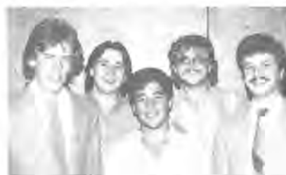
Beta Chi brothers rejoice at convention after receiving their award.

It is my opinion that the brothers of Beta Chi have exemplified the true meaning of Alpha Phi Delta. They should serve as an example for other chapters to follow. A group that works this hard, must not go unrecognized. They've set their sight on the Outstanding Chapter Award, and have worked toward it for years. Now they have realized their goal.