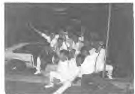
The brothers from the Third District in Toronto showing the Canadians how New "Yourkas" party.