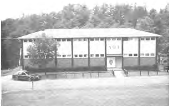
The Beta Lambda house in Loretto, PA